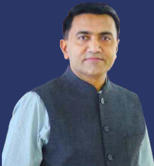
Dr. Pramod Sawant, Hon'ble Chief Minister of Goa