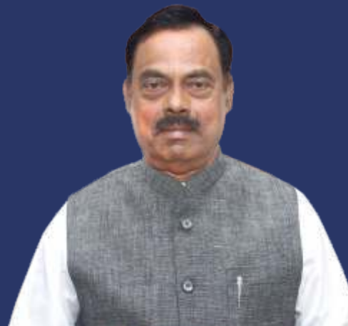
Shri Nilkanth Halarnkar Hon'ble Minister for Fisheries, Animal Husbandry and Veterinary Services, Factories and Boilers